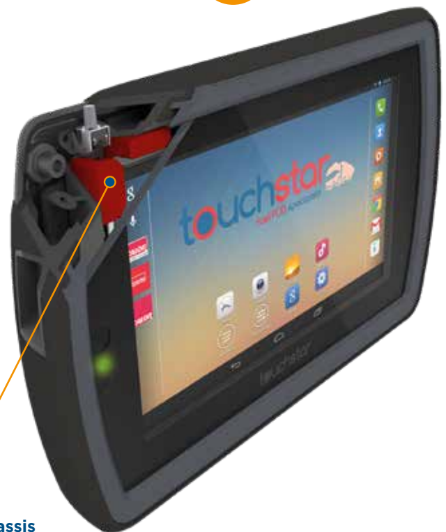
Key components protected by an internal silicon chassis

When combined with the high impact polycarbonate plastics, the TS3200 provides an extremely reliable solution that is designed to last. Not only this, TouchStar provide the long term support to guarantee seamless operation, reduced downtime and a low total cost of ownership.