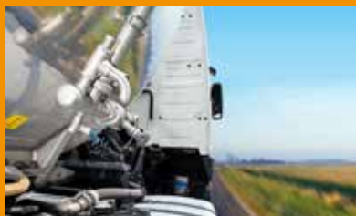
Bulk Liquid, Powder & Food Distribution