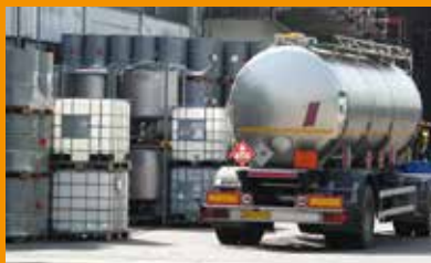
Distribution of Hazardous Goods