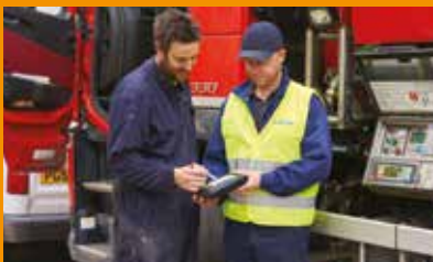
Fuel & Industrial Distribution

Front-line personnel demand rugged, reliable mobile computing devices to successfully complete job routines. The TS3200 offers proven performance in a vast number of demanding industry settings including: