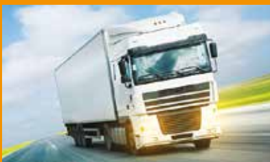
General Haulage & Transportation